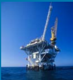
Crude Oil & Petroleum Products

THE LEADER IN WORLDWIDE ENERGY MARKET ANALYSIS